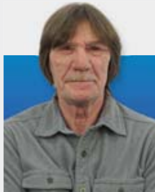
Ryan Fields Lead Photographer