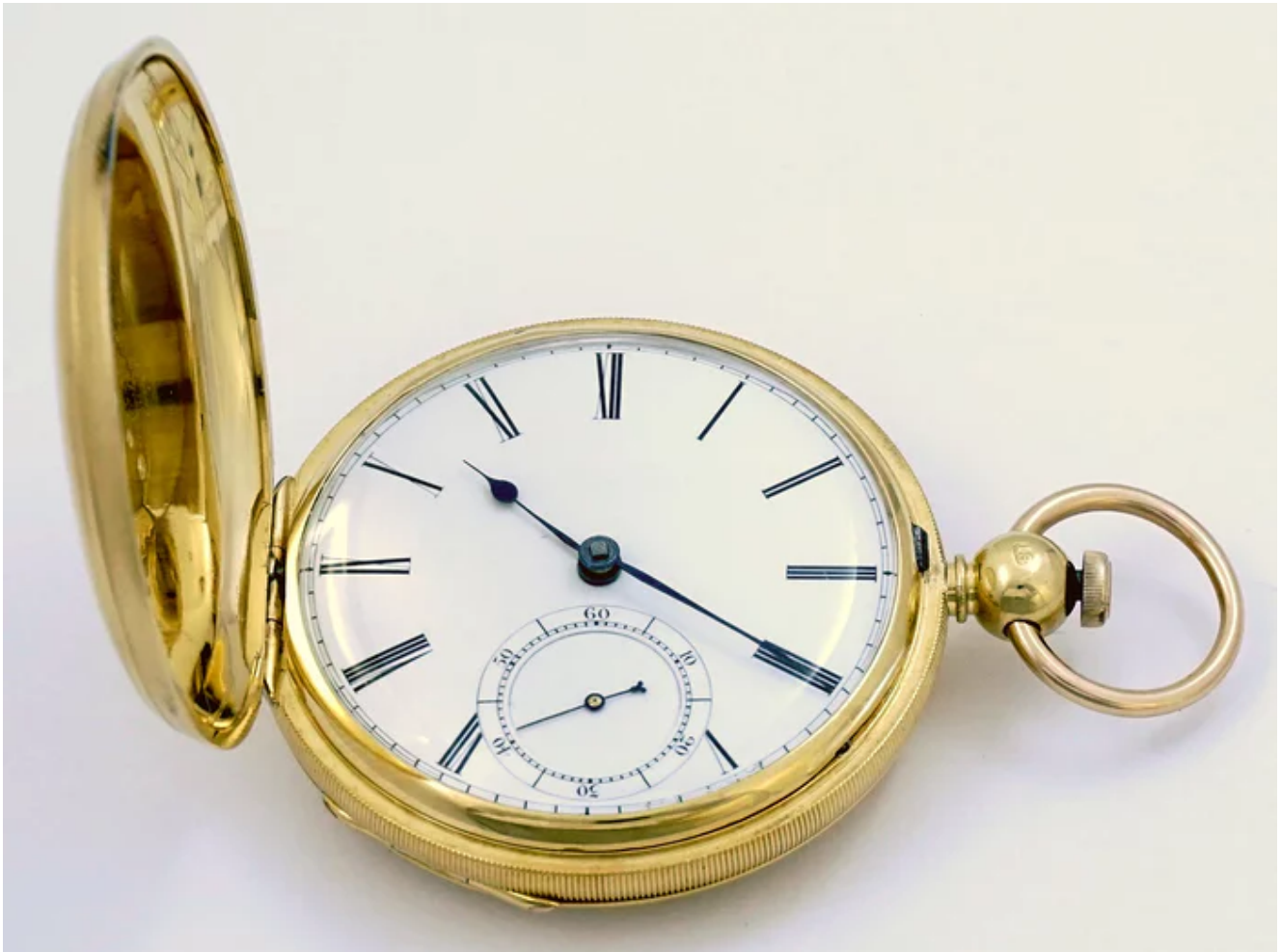
Howard Davis & Dennison #3.

will offer the Howard Davis & Dennison #3 pocket watch, which is arguably the most important American watch ever seen at auction.