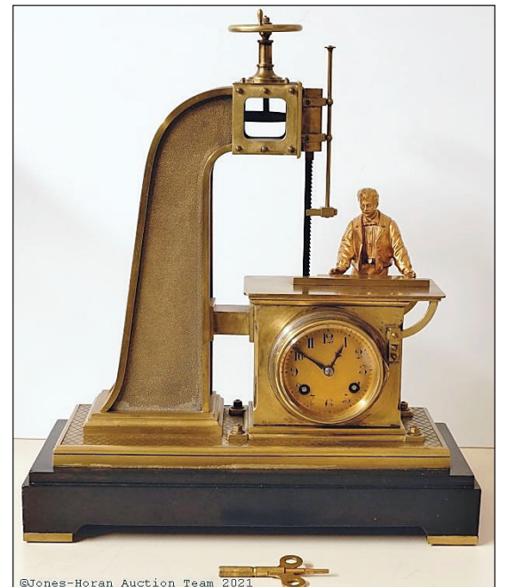
A highly unusual French table saw clock realized $6,400.

tion is set for May 1, and the firm conducts biweekly online-only auctions. For information, www.jones-horan.com or 800-622-8120.