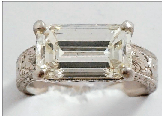
An elegant 5-carat diamond and platinum engagement ring garnered $45,000.