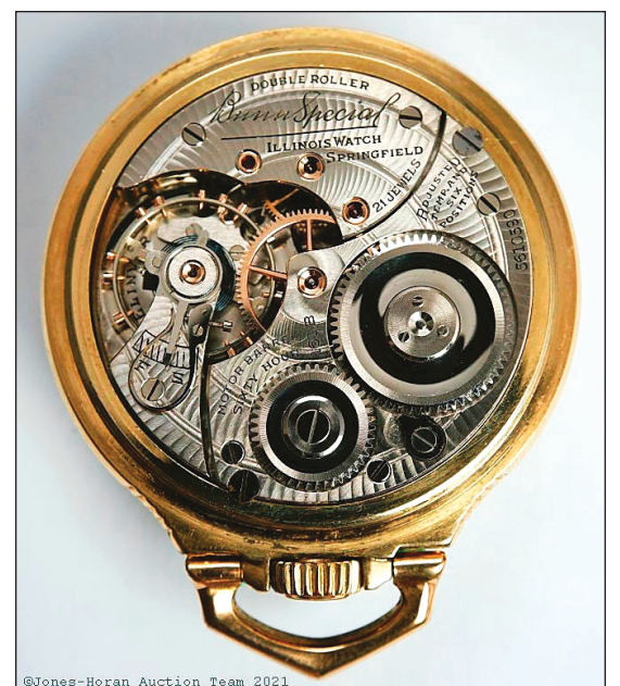
Top American pocket watch was an extremely rare Illinois Bunn Special 161B, which achieved $25,000, well over estimates.

VISIT US ON THE WEB AT AntiquesandTheArts.com