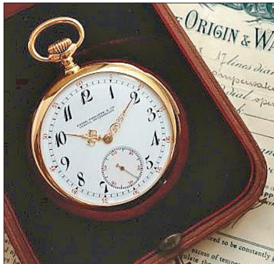
European repeaters were soaring over estimates, especially this Patek Philippe 18K minute repeater with box and paper, which surged to $33,000.

highly unusual French table saw repeating clock that garnered $6,400 and a heavy 14K yellow and white gold fancy link chain for a pocket watch,