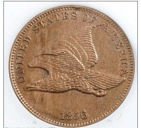
This 1856 US Flying Eagle cent immediately jumped over estimates to $19,500.